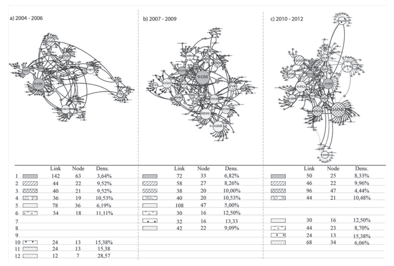
Figure 1. Infographic of strategic groups

General Motors had the higher number of relationships (degree) in the first two periods. However, it lost degree, betweenness and eigenvector from the second period on (during the crisis) and in the third period. The cluster coefficient index significantly increased in the second period and remained stable in the third one. GM was strongly associated with Fiat and Suzuki in the first period. In the second period, it broke its ties with Fiat. In the second period, GM was strongly associated with Suzuki and Isuzo and it was the central company in the network. GM lost some centrality in the third period, and Daimler became the most central company. According to results from the algorithm, GM used its relationship with Isuzo to approach Toyota, and they started acting in the same group.